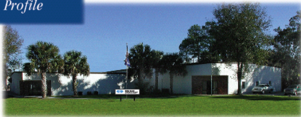
Omega headquarters and production facility in Sanford, Florida

Omega's products continue to uphold those original values. System reliability and consistent performance are the hallmark characteristics of our commitment to quality.